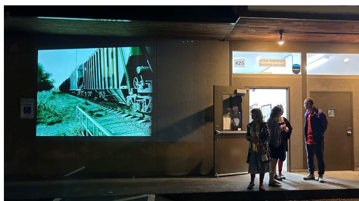
Guests watching the video after visiting the BEMRC layout

Between the day and the evening, more than 150 people came through the PNRA facility, many of whom had not previously known we existed. We look forward to participating again next year.